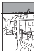
Whitby Steps M8, Zeiss 21mm lens 0.6 ND RF75 Hard Grad