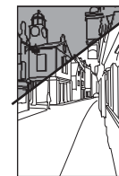
Whitby M8, Zeiss 21mm lens (handheld) 0.6 ND RF75 Hard Grad

I recently tested the RF75 with the Hasselblad XPan, using the 30mm and 45mm lenses, and also the extraordinary digital Leica M8 rangefinder. It works beautifully, film or digital. Voigtlander, Zeiss Ikon, Mamiya 7 and Bronica 645 owners should also be excited about it. I can also reveal it works with some digital compacts, my own Ricoh GX100 for example.